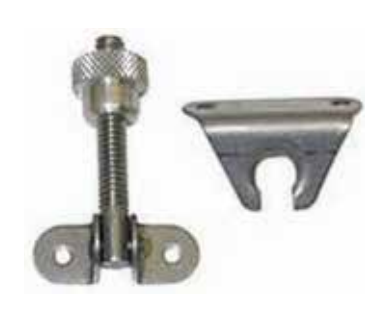
SWINGING BOLT AND PLATE 38MM (2PCE)