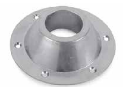
TABLE LEG TOP FLUSH