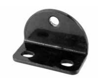
GAS STRUT MOUNTING BRACKET 008381