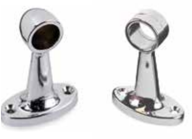
PILLAR END AND CENRE

008201 - PILLAR END 5/8" - 16MM RAIL CHROME