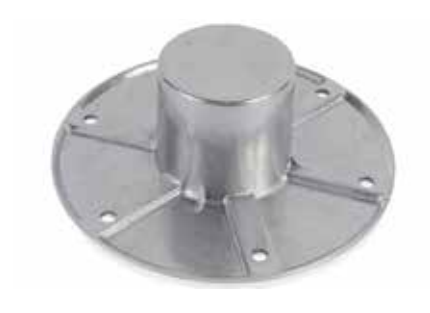
TABLE LEG BASE RECESSED

Replacement top flush plate base to suit tube 55mm in diameter.