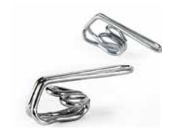
STEEL CURTAIN GATHERING HOOK NO 7 007799