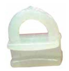
METRO CURTAIN RUNNER 035440

To suit aluminium track (refer code 036495).