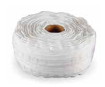
GATHERING TAPE NATURAL 007810 PER METRE