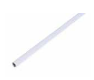
EXPANDING PLASTIC COATED WIRE 007775