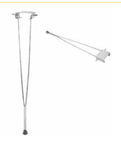
TABLE LEG - V TYPE 007904

These simple "V" shaped, chromed wire legs which lock for vertical support, can pivot horizontally under the table top for ease of storage or when the table top is being used as a bed.