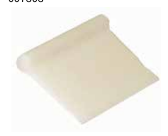
CURTAIN TAB (JAYCO) 007807