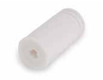
ROUND DOOR STOP AND SCREW 75MM 008228

· Threaded cylinder lock commonly used on access doors