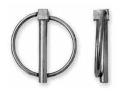
UTILITY LYNCH PIN TRACTOR CLIP B3 8MM 035385