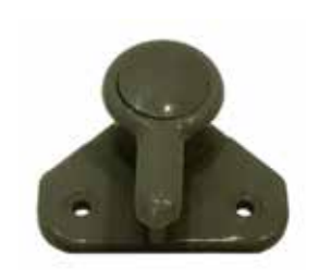
VISCOUNT POW GREY KNOB LOCK