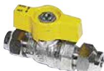
550-00650 FLARED BALL VALVE 3/8" X 3/8" BSP