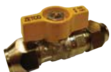
550-00700 GAS TESTING NIPPLE 3/8" flare x 3/8" male