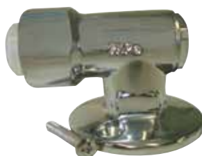
550-00711 DUST CAP T/S CHROME PLATED BAYONETS Dust cover to suit bayonet outlet.