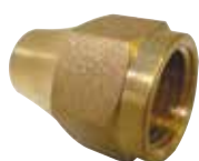
550-00642 SAE MALE X BSP MALE TAPERED ELBOW 5/16" X 1/4"