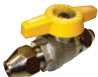
550-00652 FLARED BALL VALVE 1/2" X 1/2" BSP