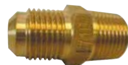
550-00624 SAE FLARE NUT 5/16"