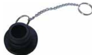
550-00712 MALE BAYONET SOCKET 1/4" BSP Comes with a 1/4" BSP male nipple for screw on attachment to a standard gas hose with compatible female union fittings.