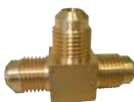
550-00636 SAE MALE X BSP TAPERED MALE UNION 3/8" X 1/8"