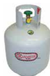
550-01010 MANCHESTER 4KG GRADE 2 GAS CYLINDER POL L/H Thread, No Gauge