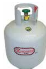
550-01302 STRAP RATCHET T/S GAS BOTTLE Ratchet strap to suit gas bottles.