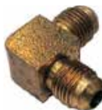
550-00634 SAE 45° FLARE BRASS FITTING, MALE UNION, 5/16 TUBE, 3/8 BSPT